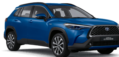
8X2 - Nebula Blue ME.